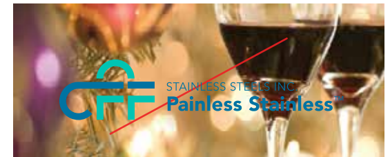
DO NOT place the logo on a busy or complicated background.