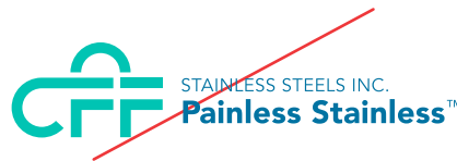
DO NOT change the colour of the logo. Except for approved variations.