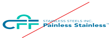
DO NOT scale the logo disproportionately.