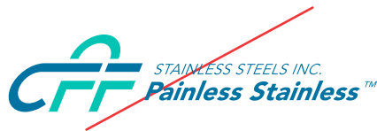
DO NOT distort the logo.